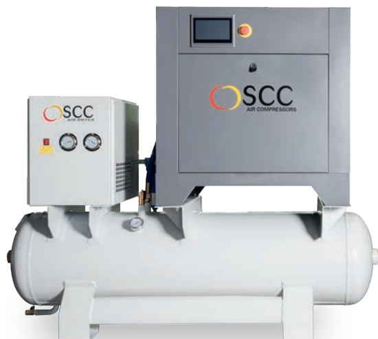
BASE VSD 7 TD

As a TD version, with refrigerant dryer, filters and compressor mounted on the receiver, you only need a power supply and the connection into the compressed air network. The compressor is immediately ready for use.